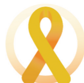
Support childhood cancer initiatives