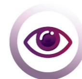
Improve eye health and eye care